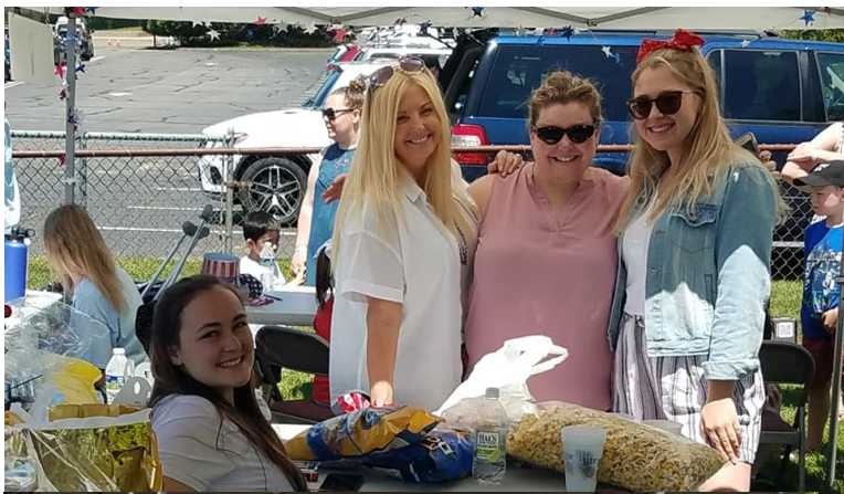
2019 May Crowning