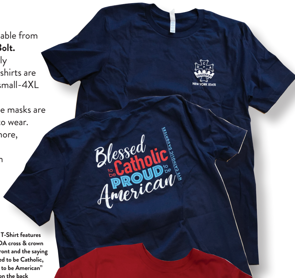
Navy T-Shirt features the CDA cross & crown on the front and the saying "Blessed to be Catholic, Proud to be American" on the back