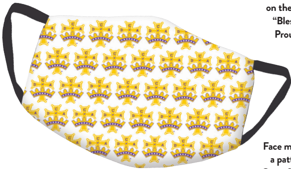
Face masks feature a pattern of the Cross & Crown logo