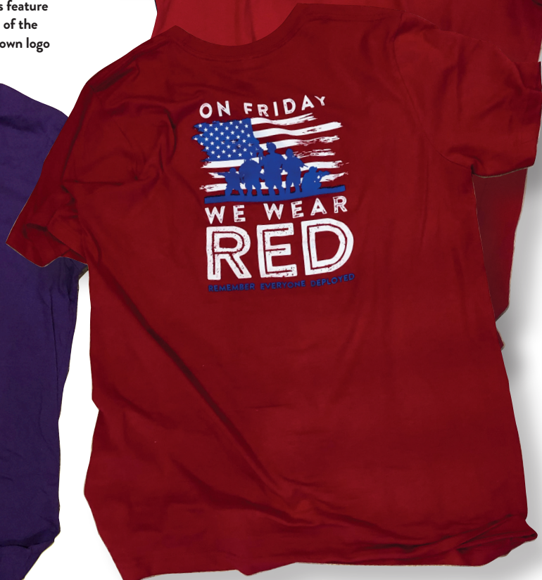
Red T-Shirt has an American flag on the front and our commitment of "On Friday We Wear RED: Remember Everyone Deployed" on the back