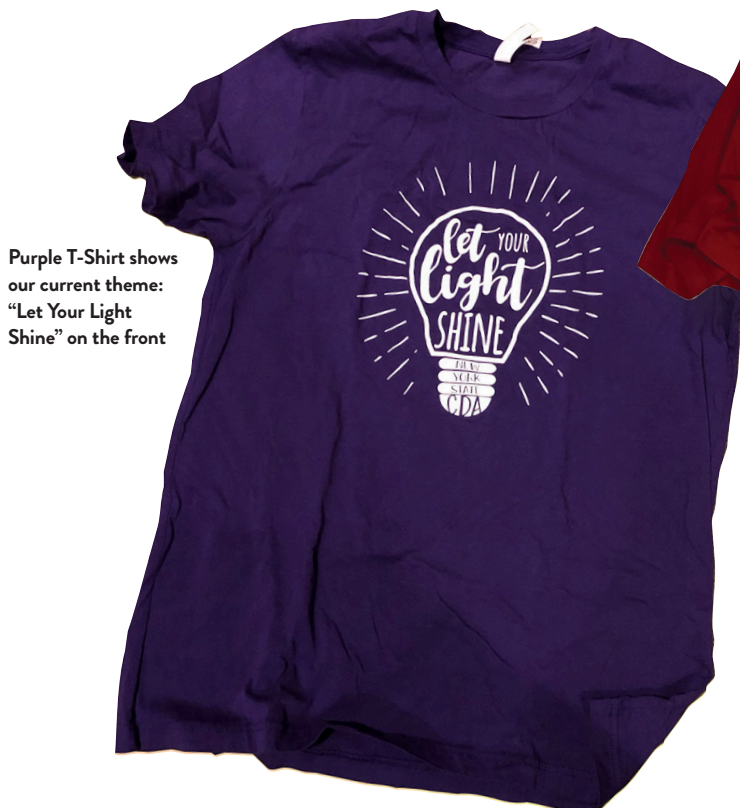
Purple T-Shirt shows our current theme: "Let Your Light Shine" on the front