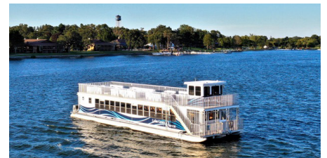
Hop aboard Delavan Lake's premier tour boat, the Lake Lawn Queen, for a truly memorable outing, or just relax in a lounge chair with a good book!