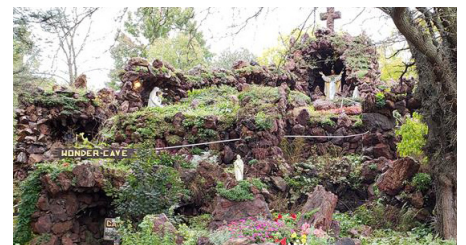
The Rudolph Grotto Gardens are set in a beautiful area of trees and flowers and provide a spiritual setting where you can spend quiet moments contemplating the wonders of God and creation.