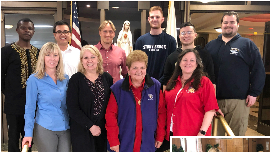
Posing with grateful seminarians after lunch at Cathedral Seminary