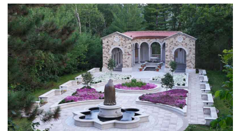
The Shrine of Our Lady of Guadalupe is a spiritual destination for pilgrims from all over the world, who yearn for the peace, love and compassion.