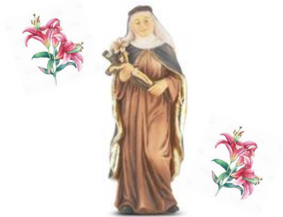
St Catherine of Siena

"Be Who God Made You To Be, And You Will Set The Word On Fire"