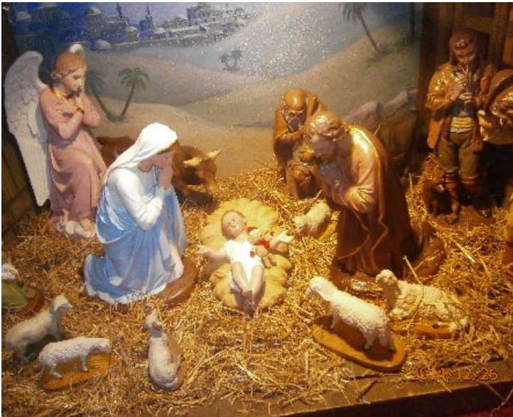
Crèche outside the Rockland County Executive’s Office, New City, NY

Our Roman Catholic Faith is quite remarkable when you truly take the time to think about it. We believe that the angel Gabriel appeared to the Virgin Mary and asked her to be the mother of God (Jesus, the second person in the Blessed Trinity). Mary’s “YES” was the most famous crisis pregnancy as she could have been stoned to death for at this time in history it was the Jewish law. Joseph was going to leave her quietly, but he was visited by an angel of the Lord in a dream: “Joseph, son of David, do not be afraid to take Mary as your wife, for the child conceived in her is from the Holy Spirit” (Matthew 1:21) There was no room for Mary to give birth to Jesus, yet God finds a way for the King of Kings, the Lord of Lords, the Most Holy to be born. The only shelter available was a stable, and there, Mary gave birth to Jesus. She wrapped him in bands of cloth, and laid him in a manger” (Luke 2:6-7) Jesus survived the slaughter of the innocents as Herod, king of Judea ordered the execution of all male children two years old and under in the vicinity of Bethlehem. As we prepare to celebrate the birth of our Savior, this Christmas brings concerns that have not been there in the past. The pandemic has impacted all our lives and we know that our technology will find a vaccine to prevent this virus from destroying the precious gift of human LIFE.